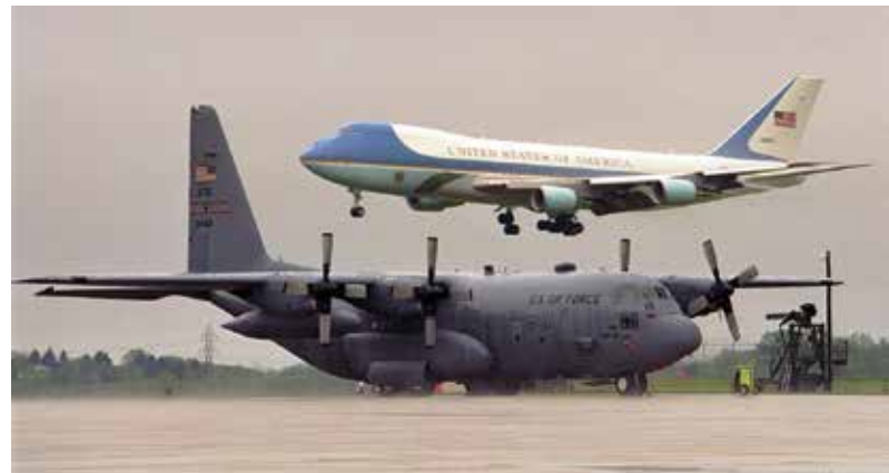
E & E conducted stormwater/wastewater monitoring at Andrews AFB to support permit compliance.

Our history of conducting environmental assessments for linear transmission systems has informed our ability to improve and streamline information management and analysis capabilities. Our environmental scientists and information management specialists—utilizing experience in the design, development, and implementation of complex environmental programs—have developed real-time, web-enabled reporting systems for a more accurate and expeditious decision making process. We regularly process diverse environmental data (chemical, geophysical, biological, and locational) and conduct modeling for analyses and reporting purposes. Much of the environmental data is maintained through the GIS services provided in SIN 899 7.