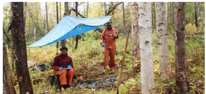
E & E conducted a high-profile, $3.5 million remedial investigation/feasibility study (RI/FS) for the Red Devil Mine, a remote mercury mine in Alaska, including preparation of the CERCLA Proposed Plan and Record of Decision. It included collaboration with BLM scientists for the sampling program.

Overall services include performance of CERCLA removal actions, RCRA interim measures, RCRA closures, brownfields support, and emergency response and management (ER&M) services.